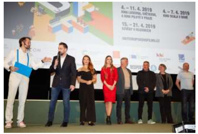
Delegation for the opening film Edmond by the director Alexis Michalik